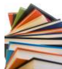
Required Summer Reading List are available for your child's English teacher and on the school's website.

learn more about the things that are on your teen's mind. These books can open the door to interesting conversations.